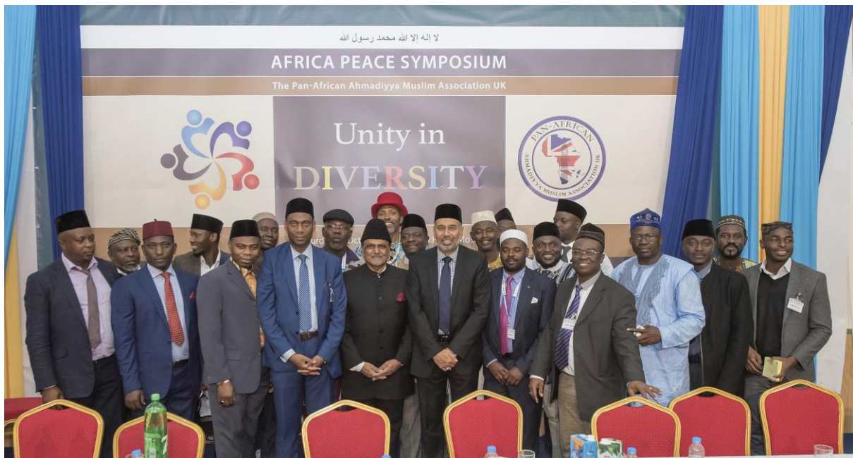
Members of the Pan-African Ahmadiyya Muslim Association UK

The initiative is being spearheaded by the Pan-African Ahmadiyya Muslim Association (PAAMA) UK - an organisation that brings people together to create a more cohesive society.