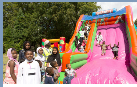
Children enjoying at Eid Milan Picnic