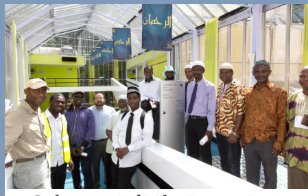
Gathering at Eid Milan Picnic at Jamia