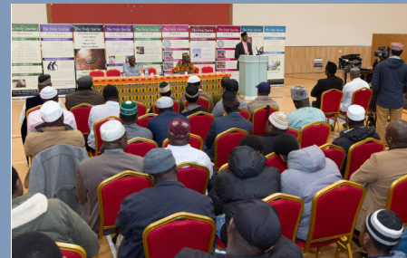
PAAMA members at a General Meeting